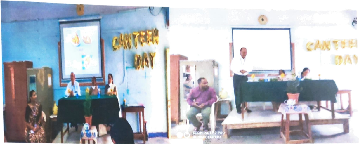
Inauguration of Canteen Day