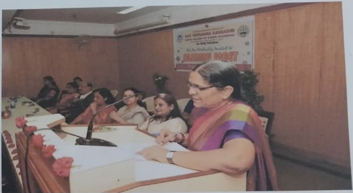
Vote of thanks