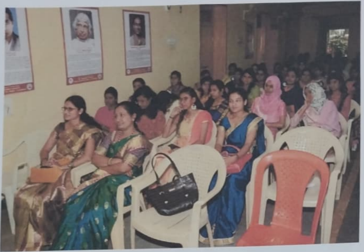
Alumnae at meet