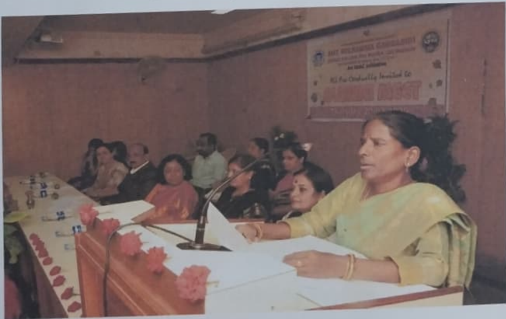
Introductory and welcome speech