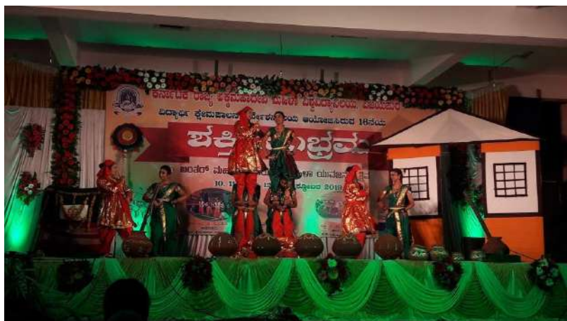
Students of our college in Dance Competition at Youth Festival