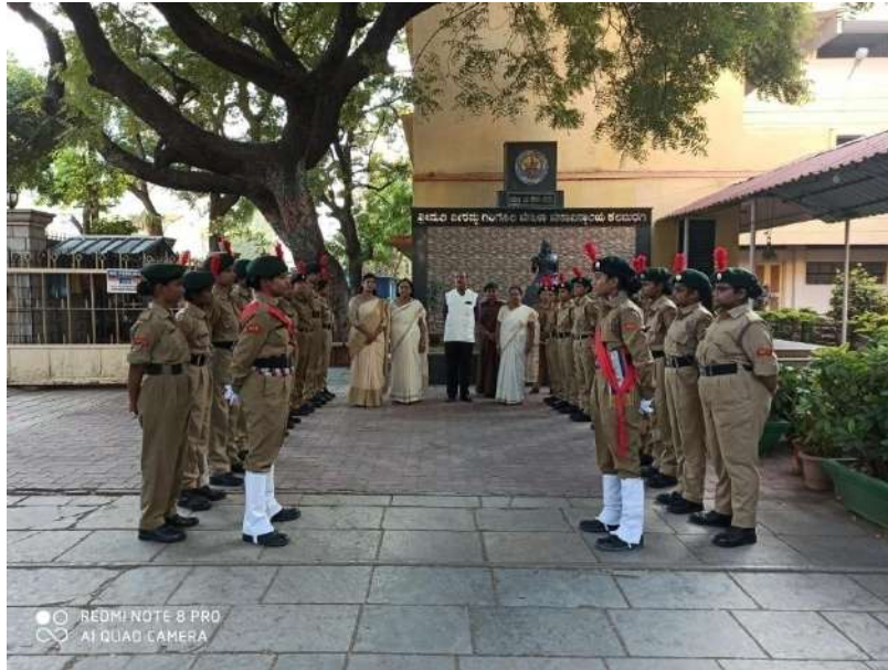
NCC Students escorting session on Republic Day