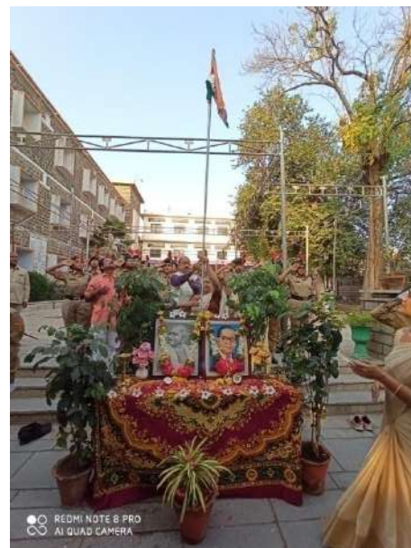
Flag Hoisting on Republic Day