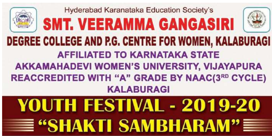
Banner of Youth Festival Participation