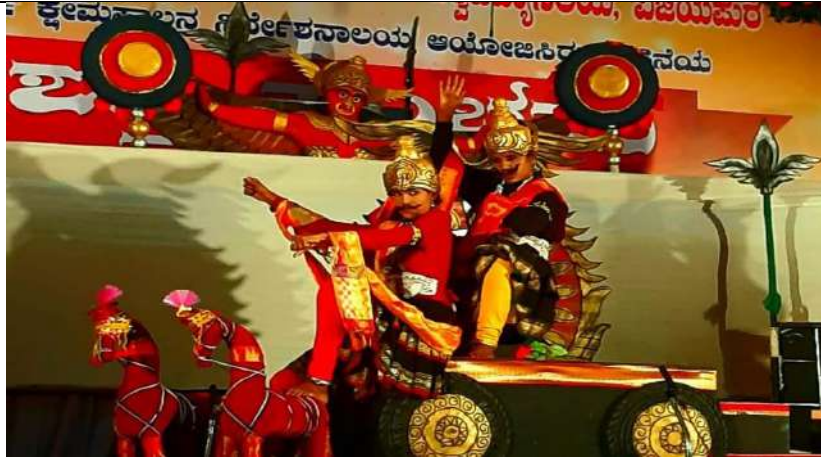
Students of our college in Skit Competition at Youth Festival