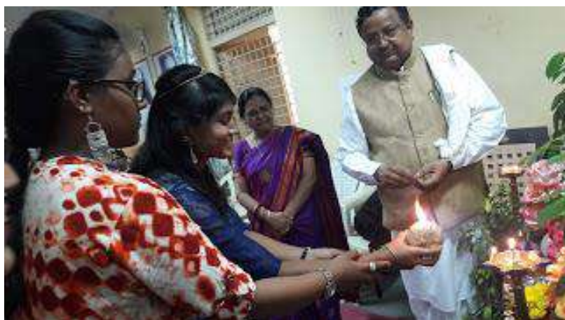
Students performing pooja