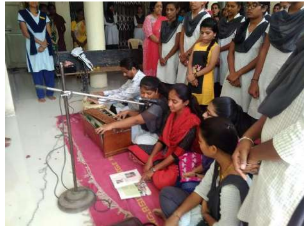
Prayer song by College Students