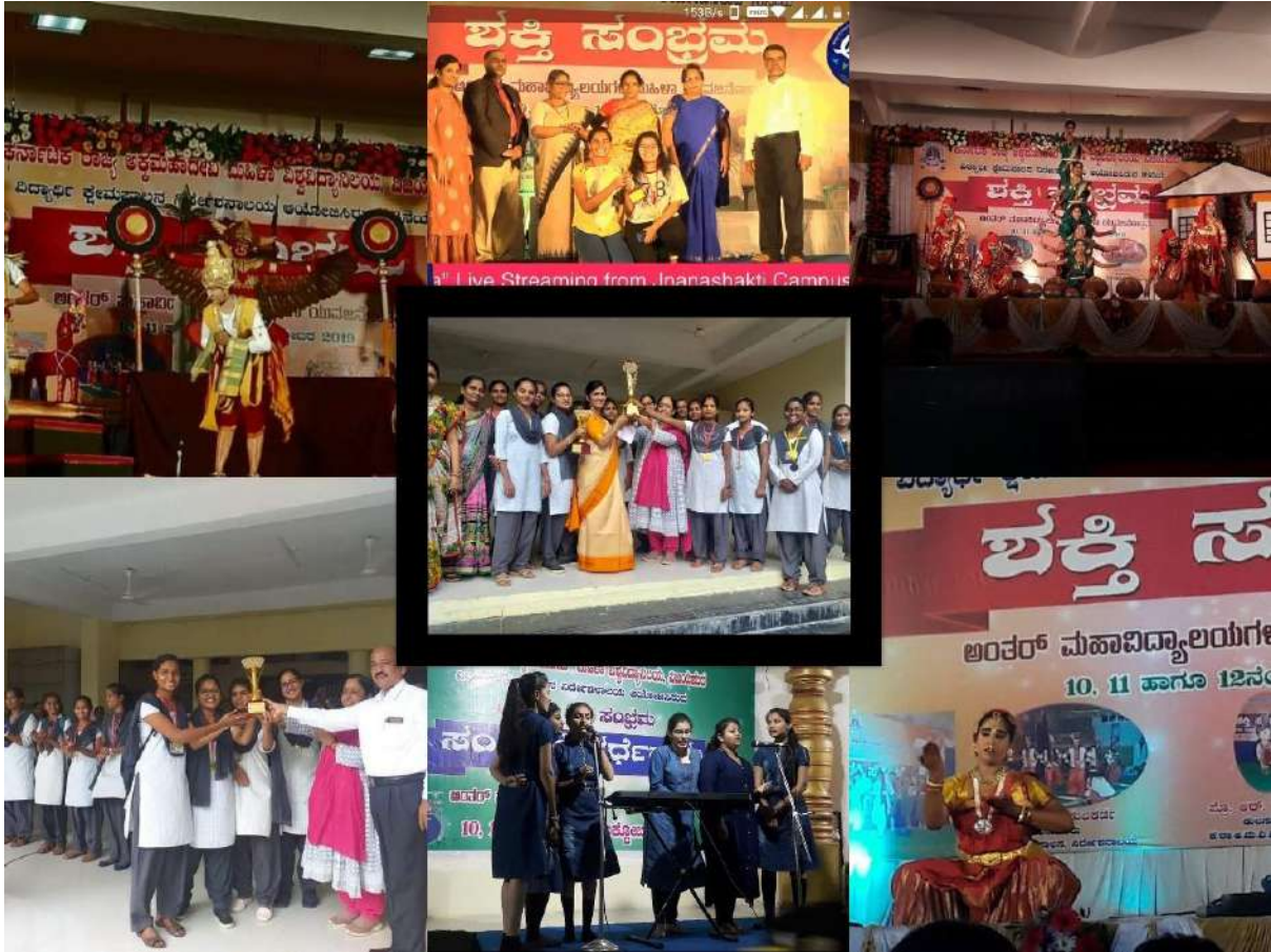
Photo Gallery at Youth Festival