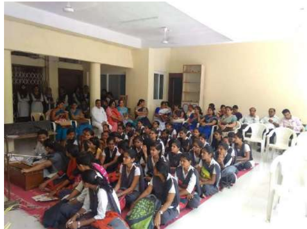
Gandhi jayanti & Lal Bahadur Shastri celebrations