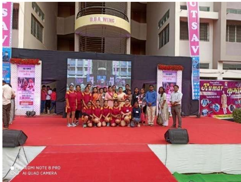
Receiving Award at SAN - UTSAV 2020 , Sangameshwar College Solapur