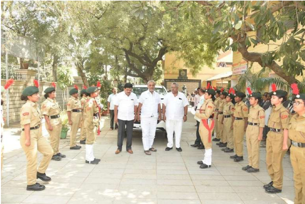
NCC Students escorting the Guests

The President spoke on the event and appreciated the students achievements and encouraged the improvements and expansions in the college activities with the staff members.