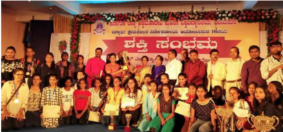
Team VGW college receiving Runner-up Trophy at Youth Festival