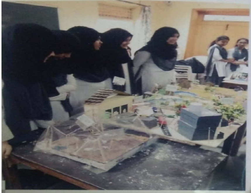
Students explaining importance of conservation of environment