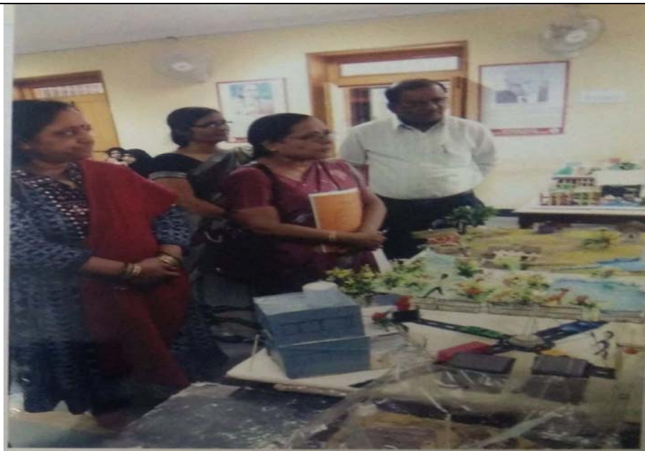
Staff members observing the exhibition