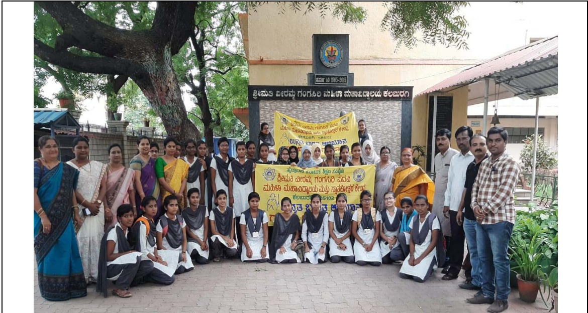
Students and staff members in Unnath Bharat Abhiyan