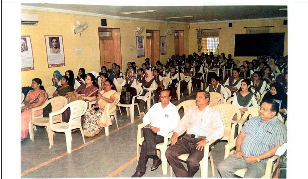
Staff members in the function