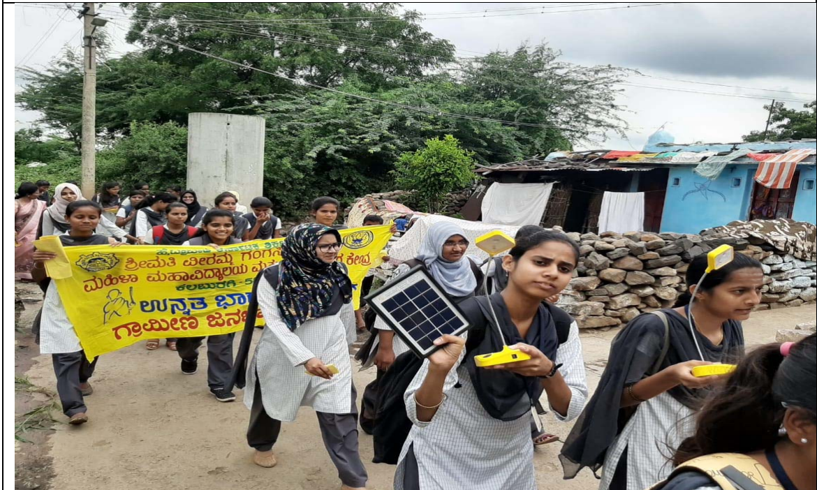
Students doing awareness on solar lamp