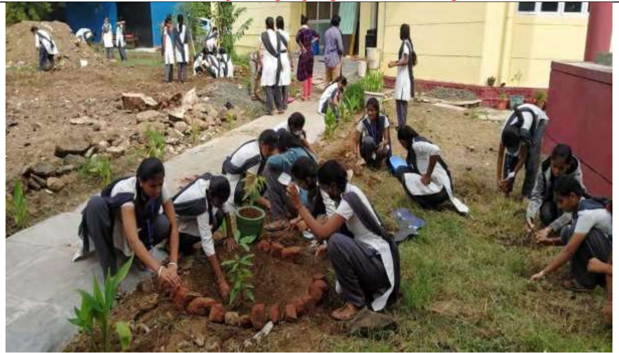
Students planting saplings in Rangayana Kalaburagi