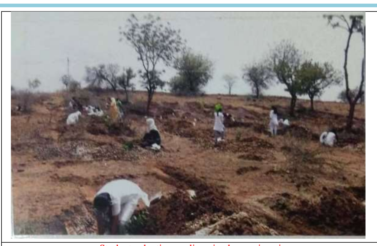
Students planting saplings in sharan sirsagi