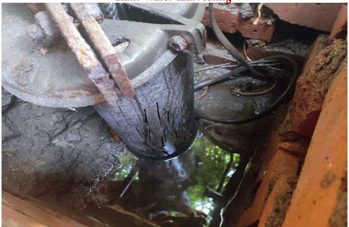
Bore well Recharge with Rain Water