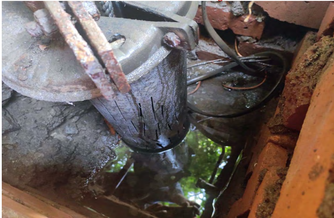
Bore well Recharge with Rain Water