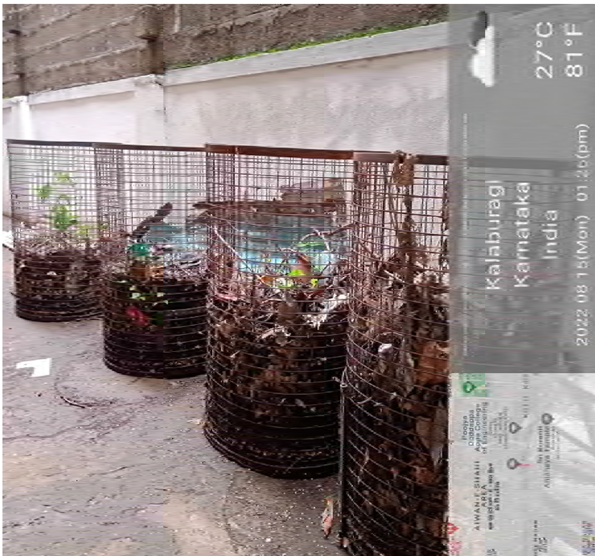
Dustbins in the campus for solid waste management

Solid waste can be categorized based on materials such as paper, plastic, glass, metal and organic waste. Solid waste disposal must be managed systematically to ensure environmental best practices in the college campus.