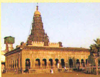
Holy Shrine Shree Sharanabasaveshwar Temple

Delegates are cordially invited to the National Seminar.