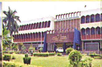
Gulbarga University, Kalaburagi